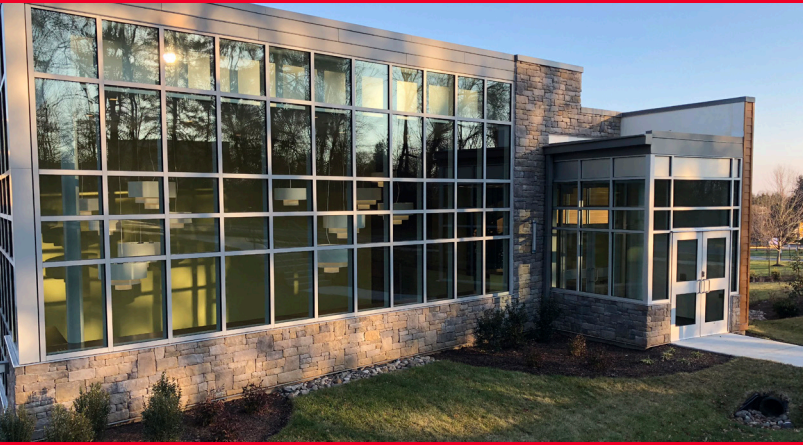
New Health Sciences Center