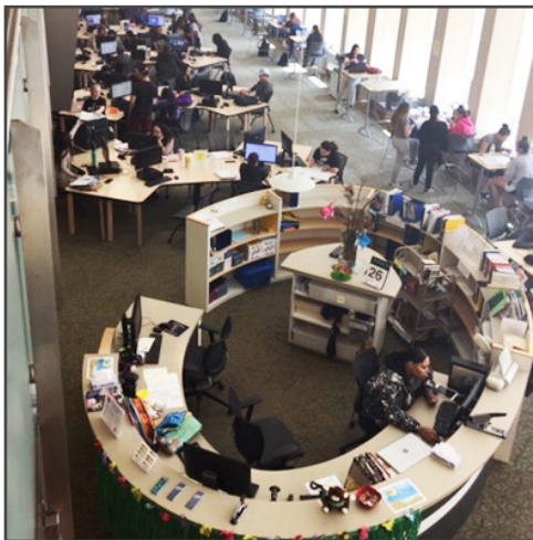
Phase II Library Wing Renovation