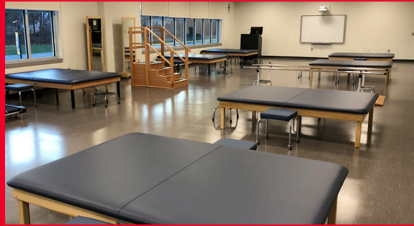
Physical Therapy Laboratory Space