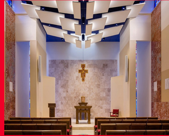
Sacred Heart Chapel Renovation