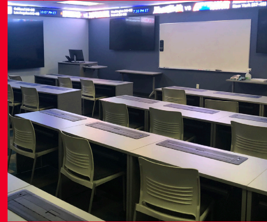
Data Analytics Lab

During the summer of 2014, renovations began for the Third Floor Bachmann Building Arts and Sciences Faculty Offices . This project featured interior redesign and renovation of office space to accommodate additional staff, more efficient use of the area, improved mechanical and electrical infrastructure and installation of high-efficiency windows. This fast-track project was completed over the 4-month summer break.