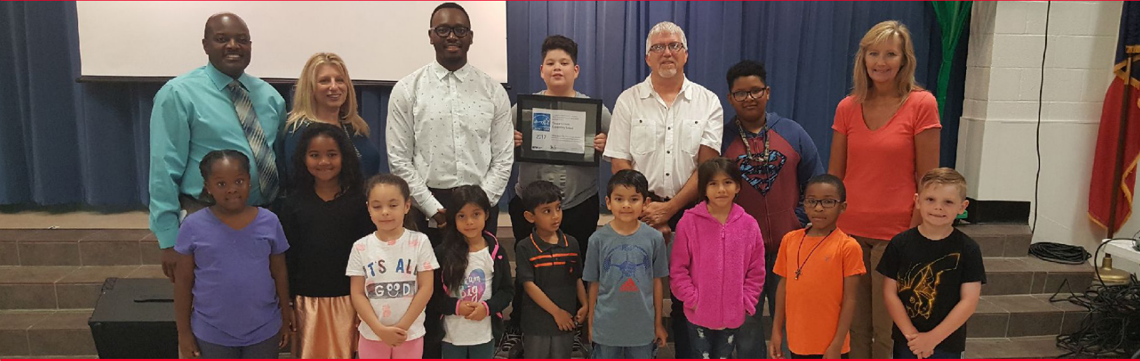
Energy Star Certification - Stewart's Creek Elementary School