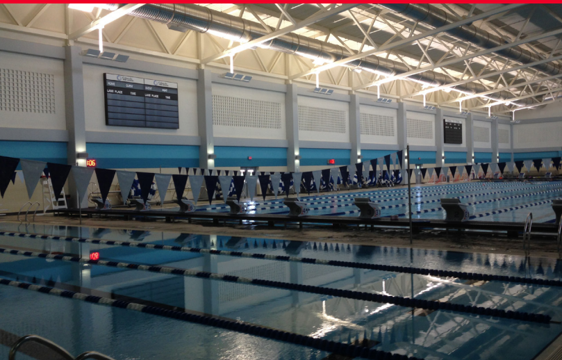
BEFORE: LED Westside Aquatic Center Project