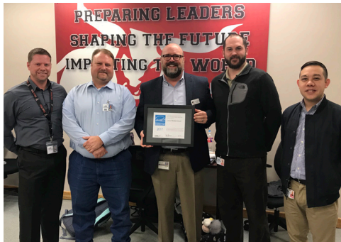
Energy Star Certification Lamar Middle School