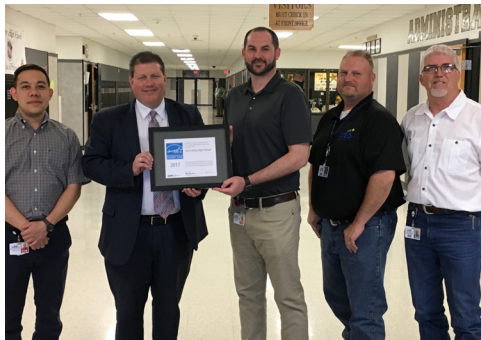
Energy Star Certification The Colony High School

To earn ENERGY STAR Certification, the U.S. EPA's recognition of superior energy efficiency, buildings must perform in the top 25 percentile of similar buildings nationwide. At LISD, Aramark certified 62 of 64 eligible schools resulting in a 98% certification rate and have earned 75 total certifications. ENERGY STAR Certification provides third-party validation of energy efficiency improvements and helps build school pride. LISD's partnerships with Aramark Engineering Solutions (ES), has helped direct more money into the classroom while reducing environmental impacts.